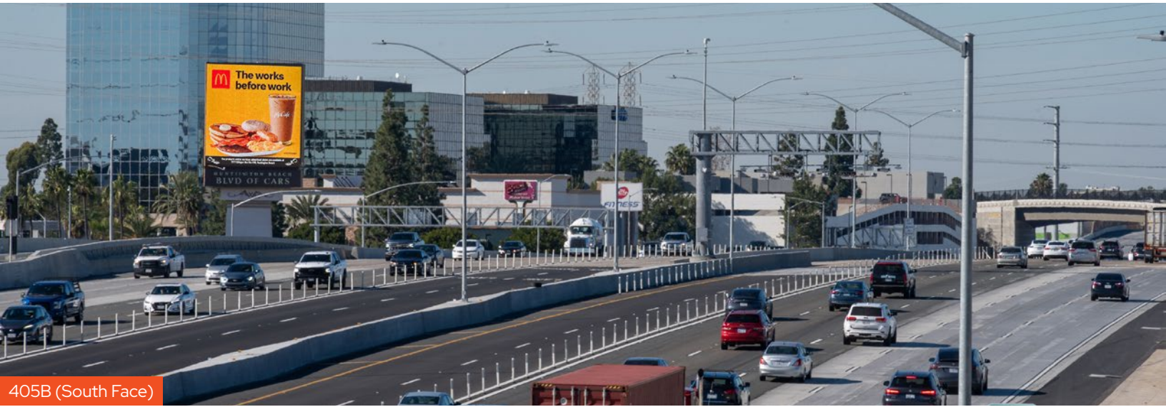
405B (South Face)

BC UNIT ID: 405 Digitals LOCATION: I-405 N/O Beach Blvd GEOPATH IDS: 405A: 30650074 405B: 30650075 SIZES: 405A: 29.5' H X 33' W 405B: 29.5' H X 33' W FORMAT: Digital FACING: North & South LAT: 33.733343 LONG: -117.991622